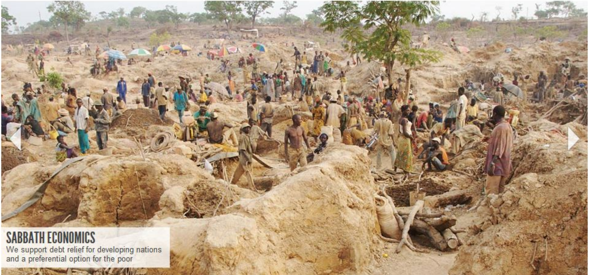
Artisanal gold mines in Guinea