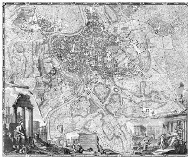
(Figure 7) Giovanni Battista Nolli. Grande Pianta de Roma . C. 1748. 12 copper plate engravings all together 69 in × 82 in.

We now turn to Nolli's map and delineate aspects of the religious and political undertones in his map of Rome by describing the symbolic nature of the architectural features and images which support and provide the foundation for the map. In this culmination of bridging past with present, ancient with modern, Roman imperialism with Papal Christian universalism, Nolli's map can be also seen as an attempt to reestablish Rome's global supremacy (Figure 7).