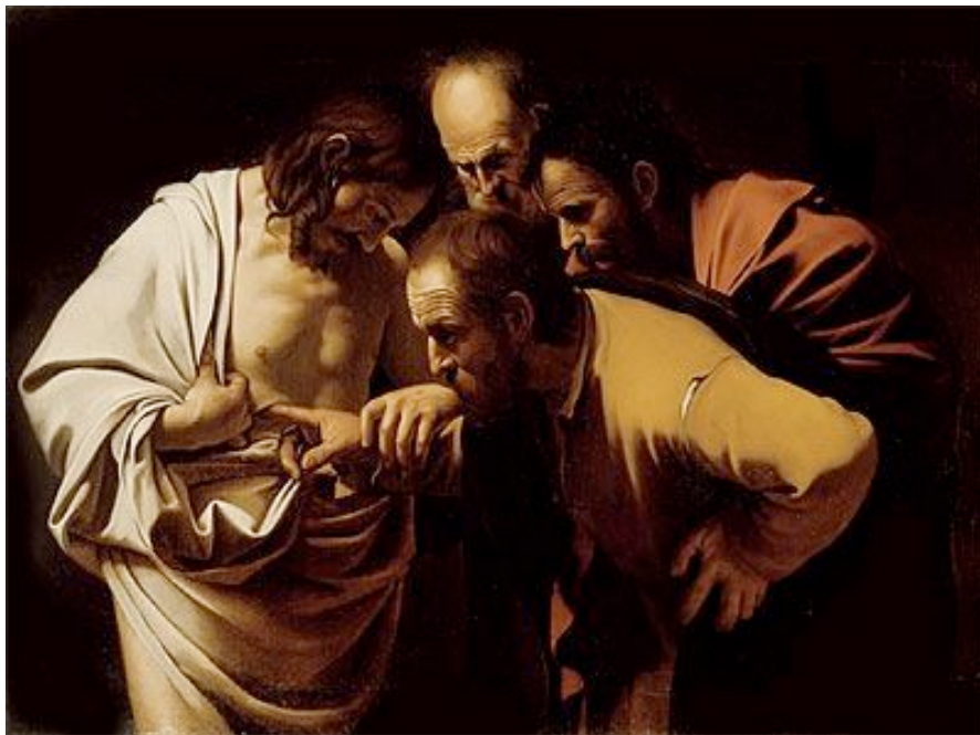
(Figure 6) Caravaggio. The Incredulity of Saint Thomas . C. 1602. Oil on Canvas 42 in × 57 in, Sanssouci Palace, Postdam,, Berlin, Germany.

Baroque painting became more theatrical and emotionally charged. Artists like Caravaggio made the Biblical stories come to life almost making you feel the pain, sweat and heat of the bodies being depicted. Caravaggio’s The Incredulity of Saint Thomas penetrates your comfort zone, it “crashes into the viewer’s space” (Shama 2007), making you feel it, believe it, and surrender to its truth (Figure 6).