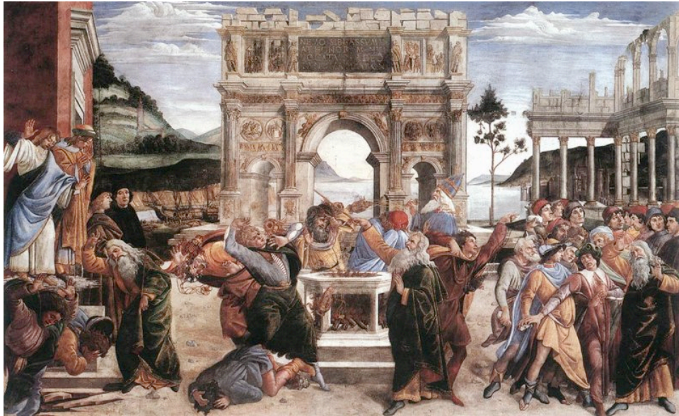
(Figure 3) Botticelli. The Punishment of Korah, Dathan, and Abiram . C.1445 – 1510. Fresco, 11'51/2 x 18'81/2". Sistine Chapel, Vatican, Rome. Commissioned by Pope Sixtus IV

The Biblical message (found in Numbers chapter 16) was a reminder of the consequences that befell those who questioned God's chosen leaders. It was designed to intimidate and subdue questions chapel visitors might have on the Papal authority.