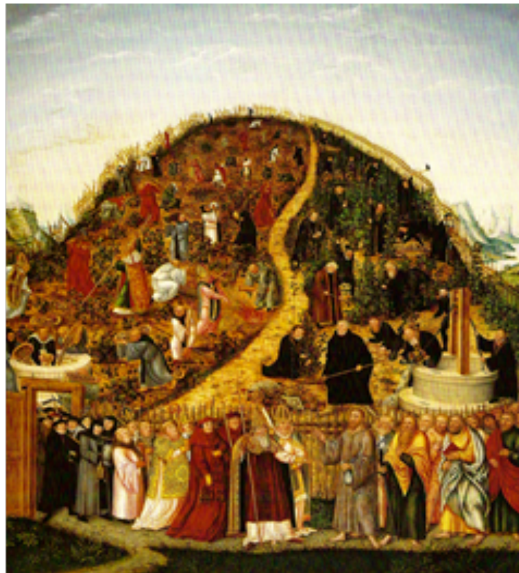
(Figure 5) Lucas Cranach the Younger. The Vineyard of the Lord . C. 1582. Wood Panel 167.5 x 145.4 Johann-Friedrich-Danneil-Museum Salzwedel, Germany.

as to say “enough.” Matthew speaks of the workers who complained about money in Matthew 10:16; “So when those came who were hired first, they expected to receive more. But each one of them also received a denarius. When they received it, they began to grumble against the landowner.” The idea of both sides working the same vineyard was soon to be made more difficult and expressed in another painting he would make just 13 years later (Figure 5).