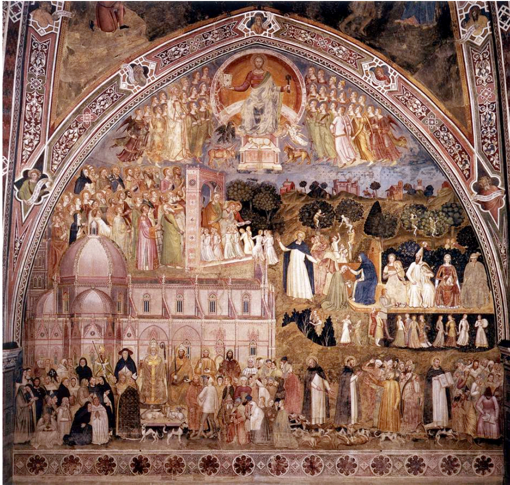
(Figure 1) Andrea da Firenze. Triumph of the Church . C.1366-68. Fresco, width of wall 31'6". Chapter House, Sta. Maria Novella, Florence.

The entire chapel speaks of how the Dominican priest's role is vital and this can especially be observed in the lower section (in the foreground) where dogs (which are metaphorically standing for Dominican priests) attack wolves (standing for heretics) which were a threat to the "Lord's flock" (fig 2).