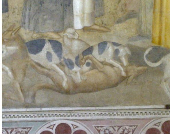
(Figure 1.a) Andrea da Firenze. Triumph of the Church . C.1366-68. Fresco, Detail of “the dogs of the Lord”. Chapter House, Sta. Maria Novella, Florence.

This fresco was painted when the papacy was at Avignon, a time when there was a rise in skepticism and political intrigue between the church and the French crown. It was an attempt by Dominican friars to establish their role as protectors of Catholic doctrine. Salvation, according to this fresco, is only obtained through the Roman Catholic church seen in the background. Eventually the popes decided to return to Italy and were determined to heal and re-establish the church through art and architecture. Within the Sistine Chapel artists were given the subjects to reaffirm the papal role. An example of this would be: The Delivery of the Keys to Saint Peter by Perugino (Figure 2).