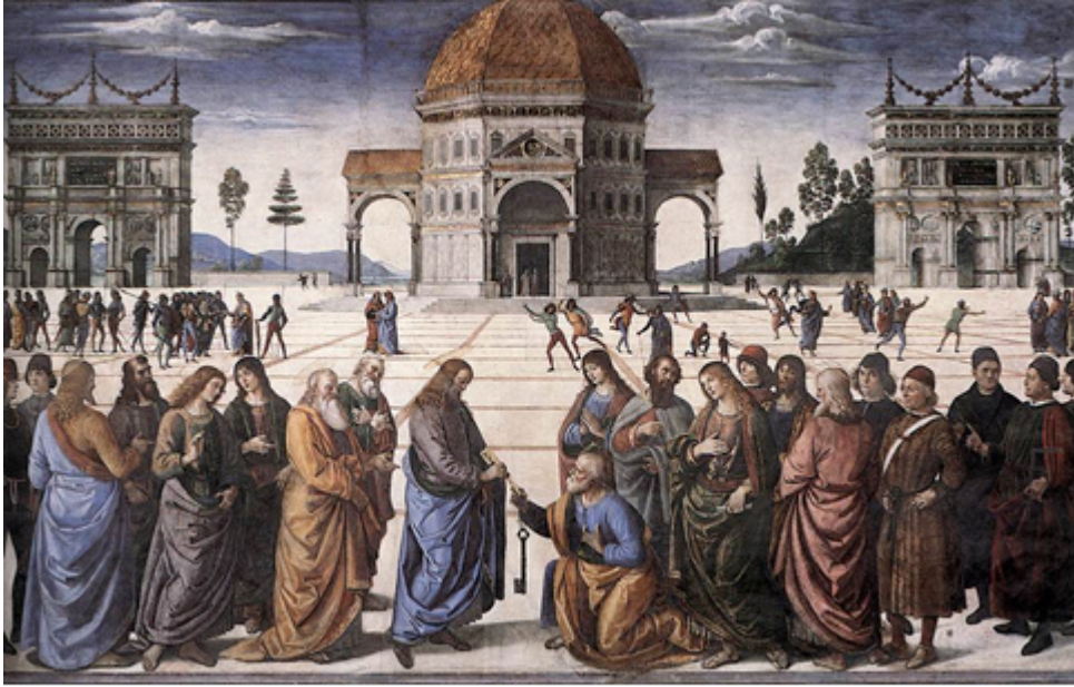
(Figure 2) Perugino. Christ Giving the Keys to St. Peter . c.1480-82. Fresco, 11'51/2 x 18'81/2". Sistine Chapel, Vatican, Rome. Commissioned by Pope Sixtus IV.

Here the artwork depicts an interpretation of what is said in Matthew 16:17-18. This image establishes the Pope who inherits the keys of the church directly from Christ. Peter, metaphorically the first Pope, is flanked by two triumphal arches both containing inscriptions that compare Pope Sixtus IV with King Solomon; the keys and the Roman arches identify Sixtus as the victorious temporal and religious ruler. The octagonal church directly behind Peter is a reference, not only to Solomon's temple, but also to the Hagia Sophia, rebuilt by Justinian in 537 who likewise identified himself with Solomon. This placement connects the popes in time and space with a long established lineage of powerful religious and temporal rulers. The perspectival lines bring our eyes from Jesus and Peter to the centrality of the church. This painting was made to legitimize papal authority and give him the justifications needed for the expense of demolishing the old St. Peter's basilica and rebuild it anew in 1506.